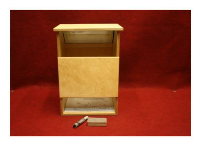
RULES MIRROR CABINET

With a shuffleboard disc you have to slide the disc as far as possible into one of the compartments. The points only count if the disc is completely in a box.