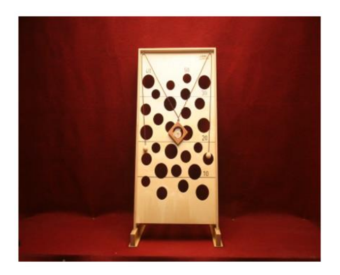
RULES HOLES & CHEESE