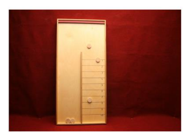
RULES SHUFFLEBOARD WITH POINTS