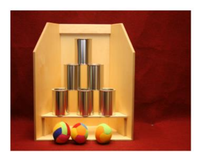
RULES THROWING CANS

Place the ball on the black spot. Use the cue to shoot the ball into the net via the ramp. Each player has 10 attempts. For each ball that ends up in the net the player receives 5 points. Then add up all the points.