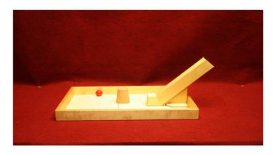
RULES CAT AND MOUSE

The two players try to guide the cheese through the holes using the ends of the rope, aiming to finish as high as possible. No points can be earned until the first line, after which points are awarded based on the number indicated..