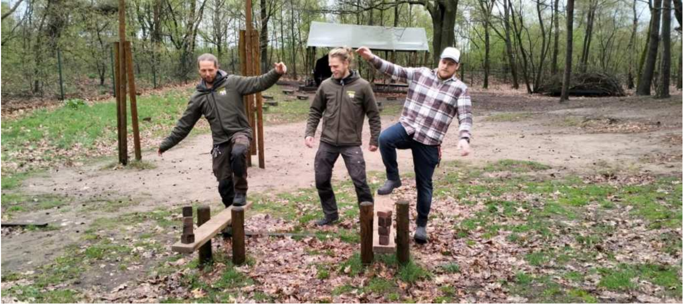
Keep switching until every participant has had a turn